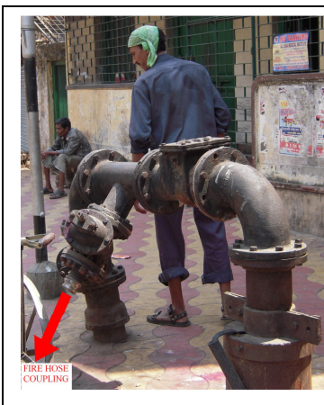
FIRE HOSE COUPLING